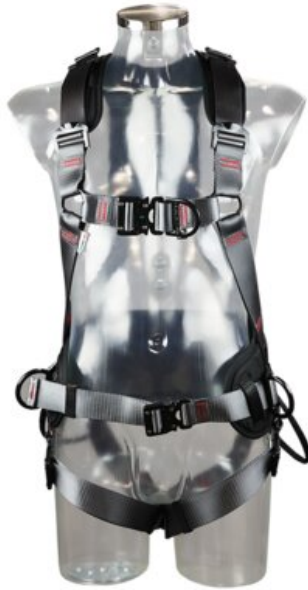
Work positioning D-ring