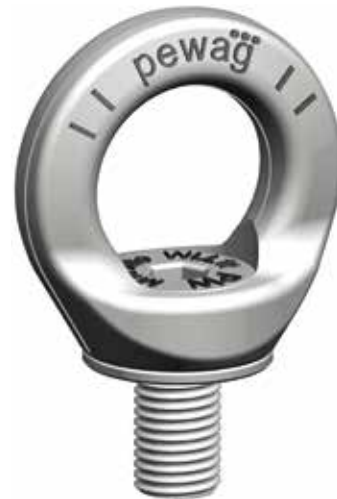
PLGWI basic pewag winner profilift gamma inox lifting point

This operating manual is valid for: PLGWI basic pewag winner profilift gamma inox Dismountable lifting point